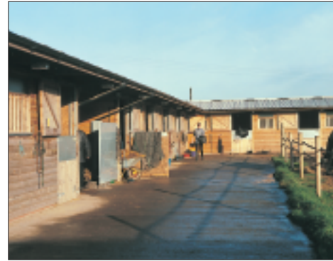
'U' shaped commercial livery yard incorporating many features from the Thoroughbred Range, such as a fibre cement roof, 4 x 2 inch framing, fully lined with heavy duty kicking boards and more extensive chew strips.