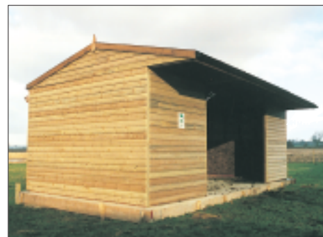
24 x 12ft Static Livery Range Field Shelter, 8ft to the eaves, with a 12ft opening and an apex roof with a 3ft front overhang.