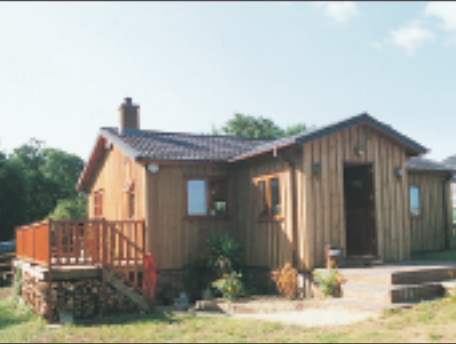
Framed Timber Lodge to provide residential accommodation for the owners of a riding school in Surrey.