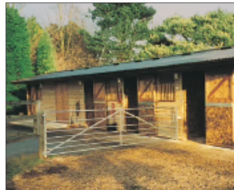
Private competition yard in East Yorkshire, featuring dark brown fibre cement roof to compliment the buildings' attractive setting.