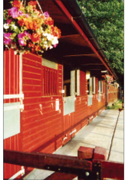
Block of four 12 x 12ft Thoroughbred boxes in West Yorkshire, with optional wood stain. Thoroughbred Range features include 4 x 2 inch framing, heavy duty kicking boards, heavier ply wood lined doors and a more extensive chew strip arrangement.

That's why John Goodrick Equestrian Developments are the leaders in the field - you can see the difference.