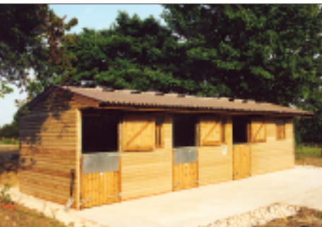
Block of three stables near Nottingham. The larger 16 x 12ft end stable is designed for foaling or storage. The Farmscape fibre cement roof blends particularly well into its attractive rural surroundings.