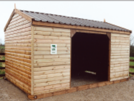
Popular mobile field shelter, available in various sizes, with options available such as front canopy and doors. Planning permission is not required in most cases.